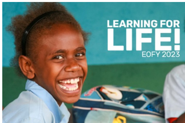
2023 end-of-financial-year campaign: Learning For Life!

Marketing & Fundraising stays in touch with the MJF's community of supporters through targeted EDMs and social media. Each year it runs a fundraising campaign at the end of the