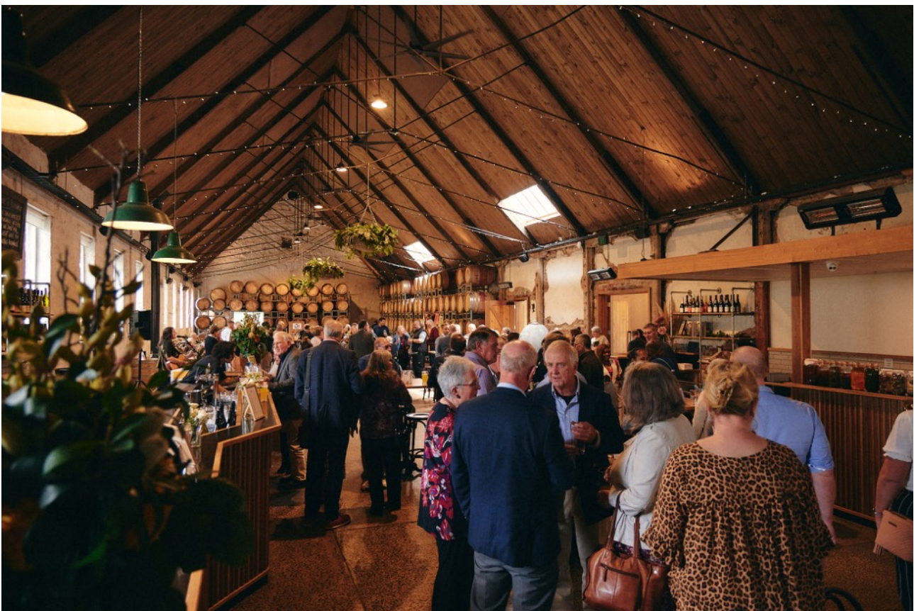
10 Years Of Impact celebration and fundraising event, Fyansford, Australia.

In general, Marketing & Fundraising tries not to campaign too hard for donations, as the MJF's supporter base is modest (under 400 on the EDM list, 1.2K followers on Facebook).