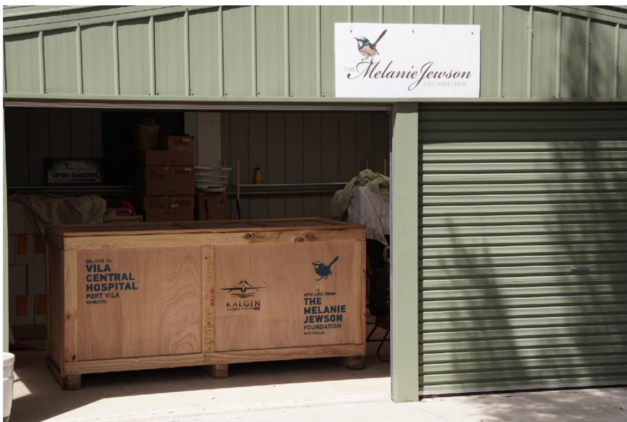
Crate packed and ready to be shipped to Vila Central Hospital, Port Vila.