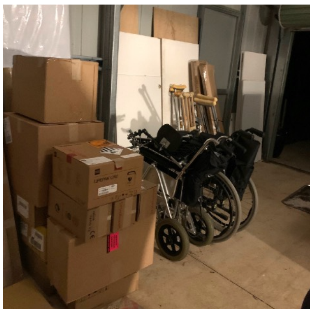
Medical equipment boxed and ready to be packed into the crate. Bannockburn, Australia.