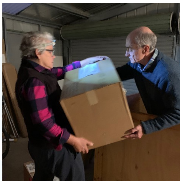
Packing the crate. Bannockburn, Australia.