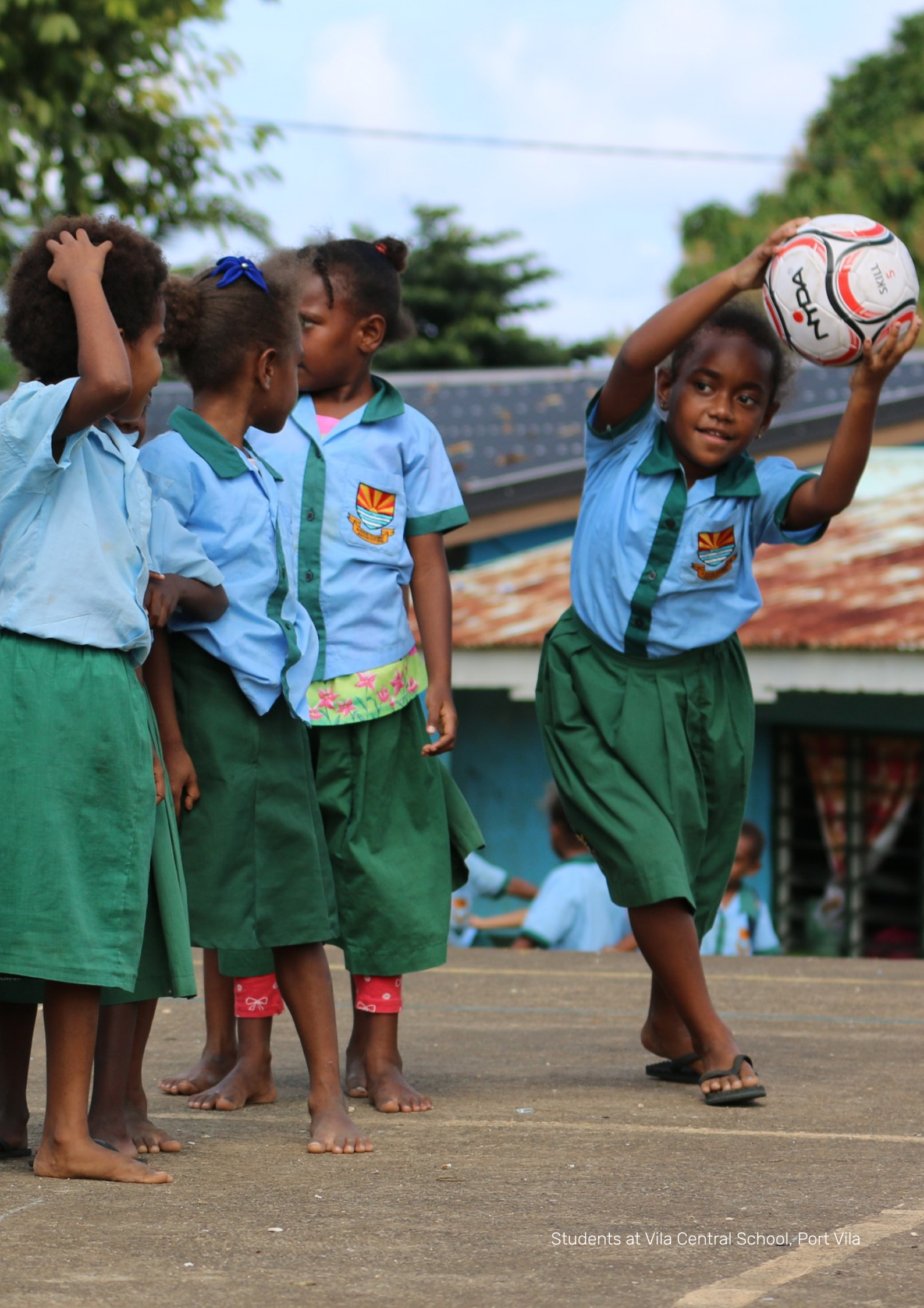
Students at Vila Central School, Port Vila