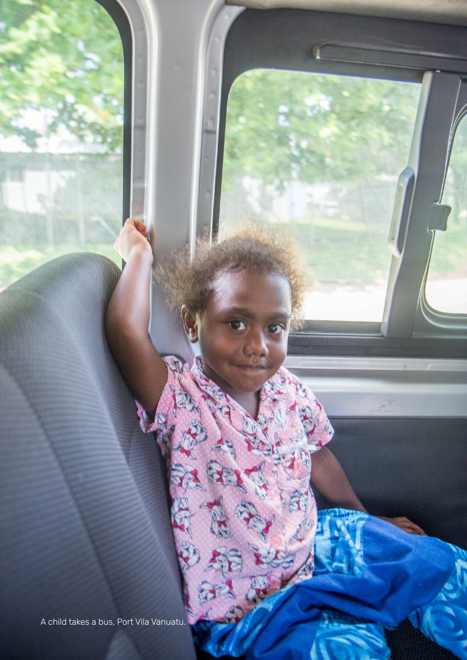
A child takes a bus, Port Vila Vanuatu.