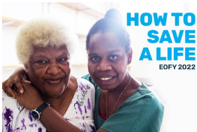
2022 end-of-financial-year campaign: How To Save A Life.

Due to the disruption of COVID, unfortunately the MJF wasn't able to hold its usual annual 'Spring Film' fundraising event in the second half of 2021. However planning did get underway for the foundation's '10 Years of Impact' fundraising and celebratory event, scheduled for October 2022