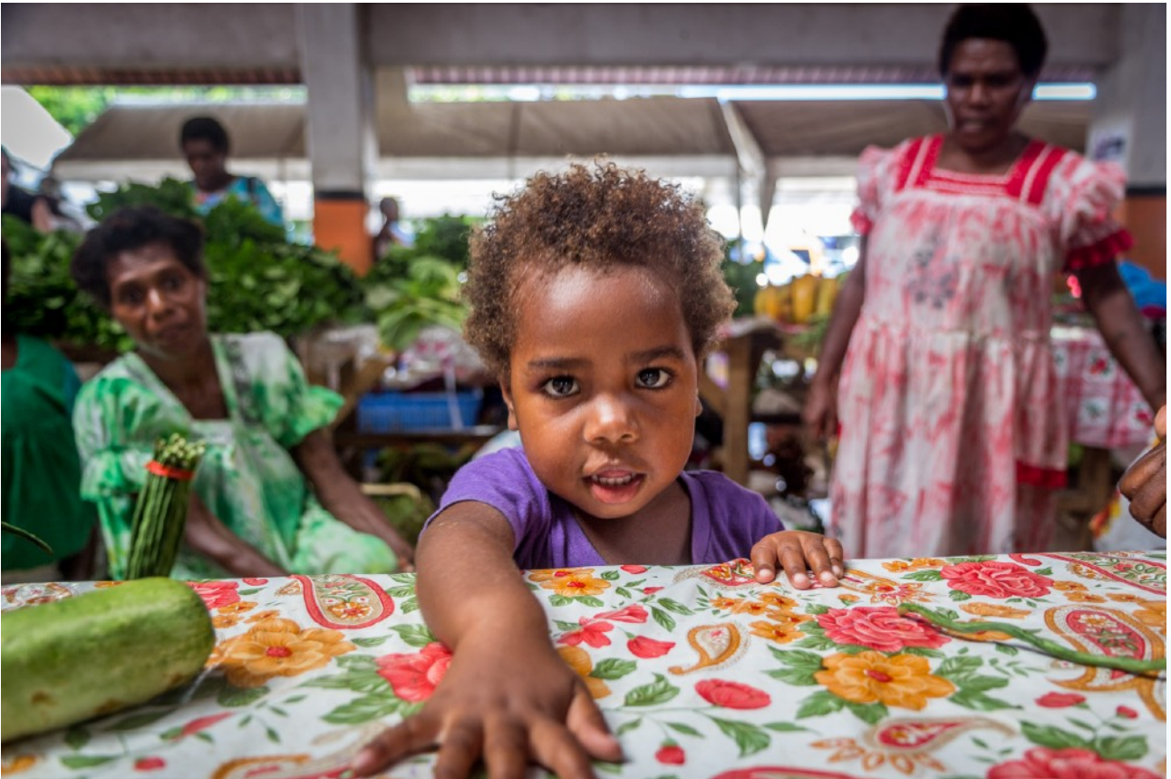
A child at Vila Central Market, Port Vila.