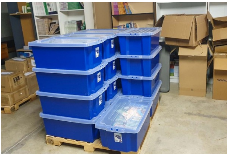
17 bins full of books ready to be transported to Sanma Province.

A strong education system is crucial in any society, and this is emphasised by Goal 4 of the UN's Sustainable Development Goals which says: 'Ensure inclusive and quality education for all and promote lifelong learning.'