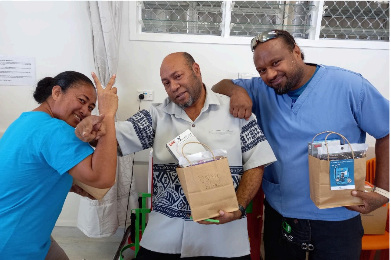
Staff with MJF-donated Rapid Assessment Kits, Vila Central Hospital, Port Vila.