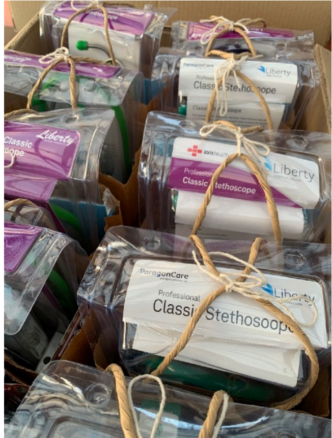
MJF-donated Rapid Assessment Kits packed and ready to be shipped to Vila Central Hospital, Port Vila.