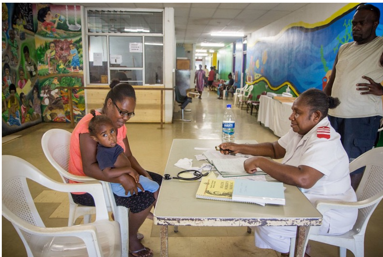
Nurse with patient and parent, Vila Central Hospital Paediatric Department.