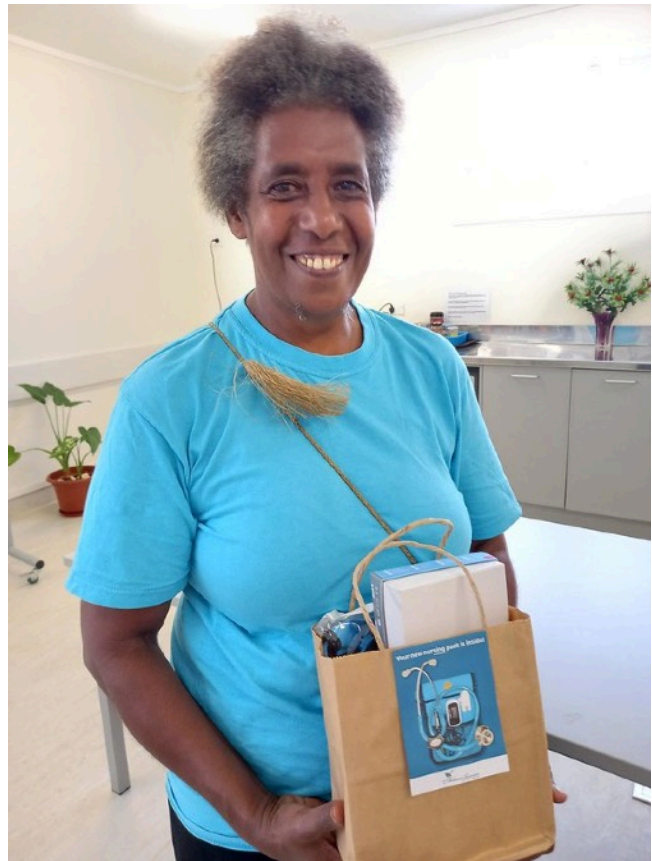
Nurse with her brand-new MJF-donated Rapid Assessment Kit. Vila Central Hospital, Port Vila.

Our educational work currently focuses on the supply of quality reading material for pre-reading, early readers and other resources in the primary school. These educational resources are sourced through Read Pacific ( https://readpacific.co.nz/ ), a New Zealand based company that focuses on supplying culturally appropriate educational resources to the Pacific Islands. Read Pacific also