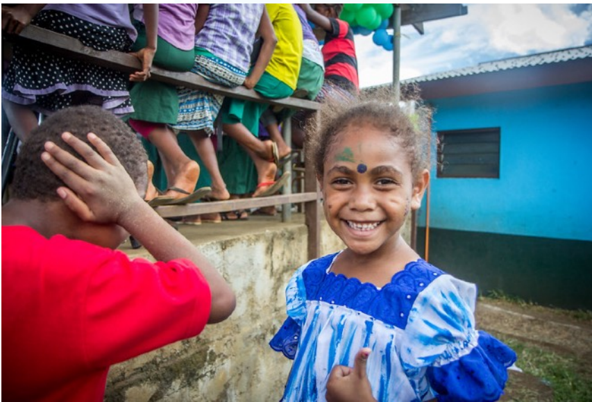
A student at Vila East Primary School, Port Vila.

Compulsory education in Vanuatu only applies to the first six years of primary schooling. A further four years of junior secondary and three years of senior secondary is available to students, however, most conclude their education at the end of Primary school and enter the workforce with limited literacy and numeracy skills. Formal education is not available at all in some remote villages of Vanuatu.