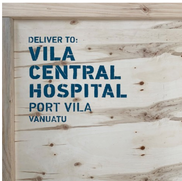
2020 crate branded and packed, ready to be transported to Vanuatu.