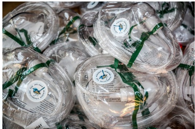
Masks branded with MJF stickers, packed and ready to be shipped.

The MJF's brand identity takes many forms – from marketing collateral, (like brochures and business cards), to consistent marketing copy, and branded stickers and stamps for donated items. This financial year Marketing & Fundraising branded a large crate full of donated goods before they were sent to Port Vila. The central goal with all the branding work is to build trust and recognition in the MJF as a reliable, professional organisation, with both supporters and recipients alike.